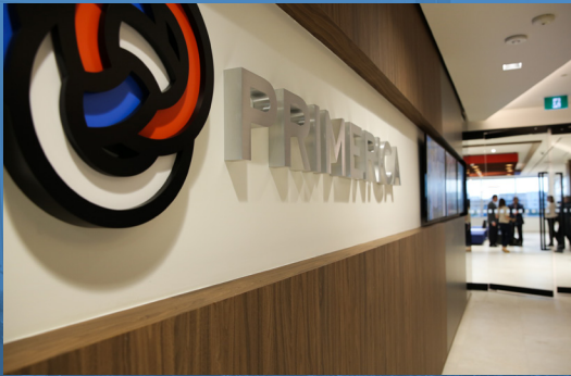
Primerica Canada's headquarters in Mississauga, ON, services more than 12,000 Canadian representatives who help thousands of families throughout Canada.

Founded in 1977, Primerica is focused on the middle-income market. Primerica teaches people important financial concepts including how to become debt free, properly protected, and financially independent. Our home offices in Duluth, GA, and Mississauga, ON, support thousands of independent contractor representatives serving families across North America.